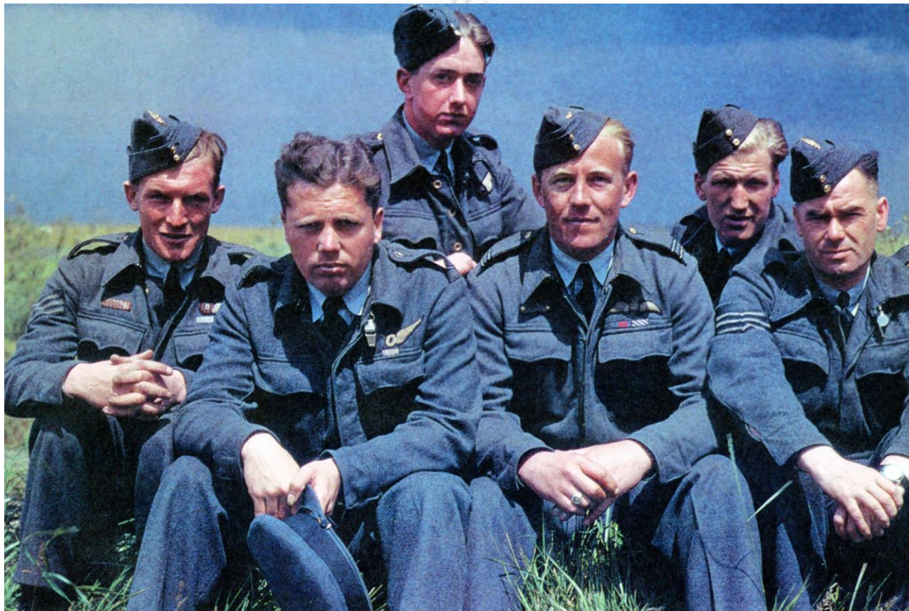
GUY PENROSE GIBSON VC and other members of RAF 617 Squadron shortly after the Dams Raid on 16 May 1943. Gibson second from left.